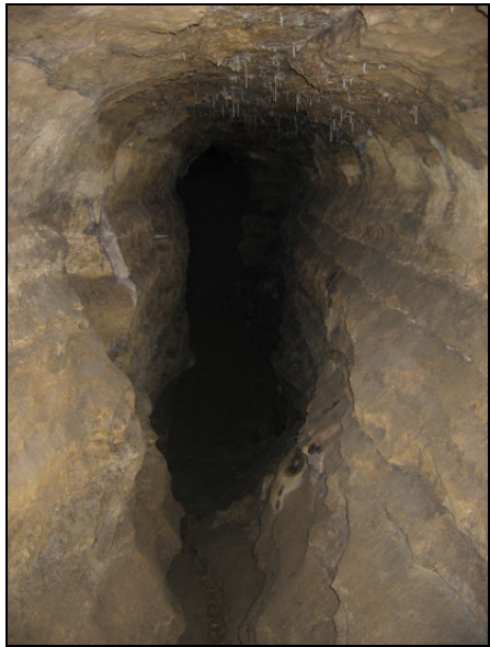
Inside the cave