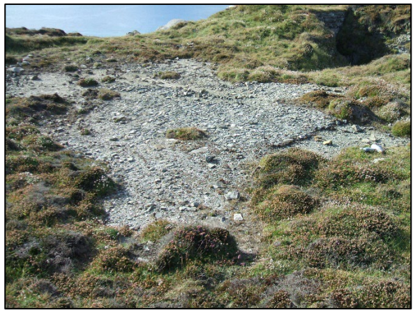
Cobbled dressing floor at Brow Head Mine.