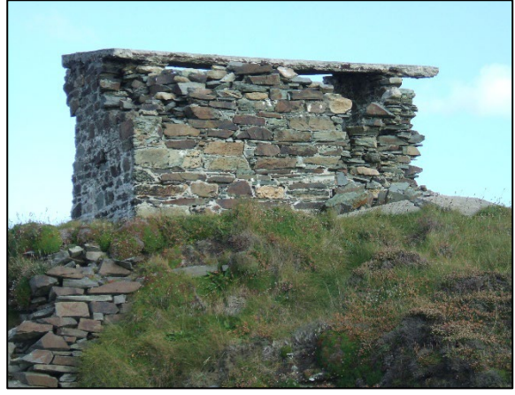
Remains of powder house (magazine) at Brow Head Mine.