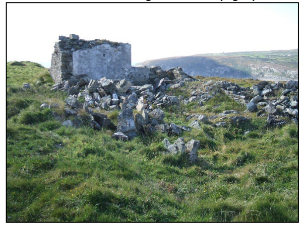
Remains of engine house at Brow Head Mine.