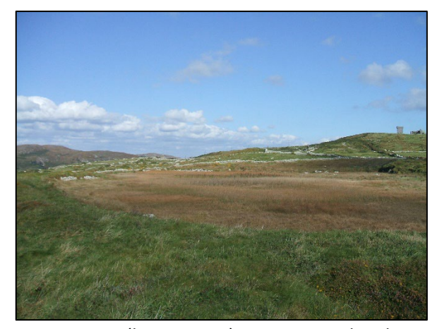
Reservoir (brown area) at Brow Head with watch tower visible in background right.