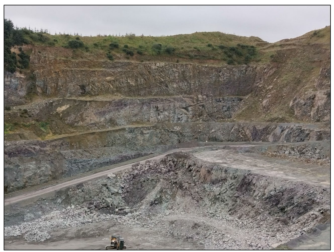
Bweeng Quarry, view of quarry floor and south wall.