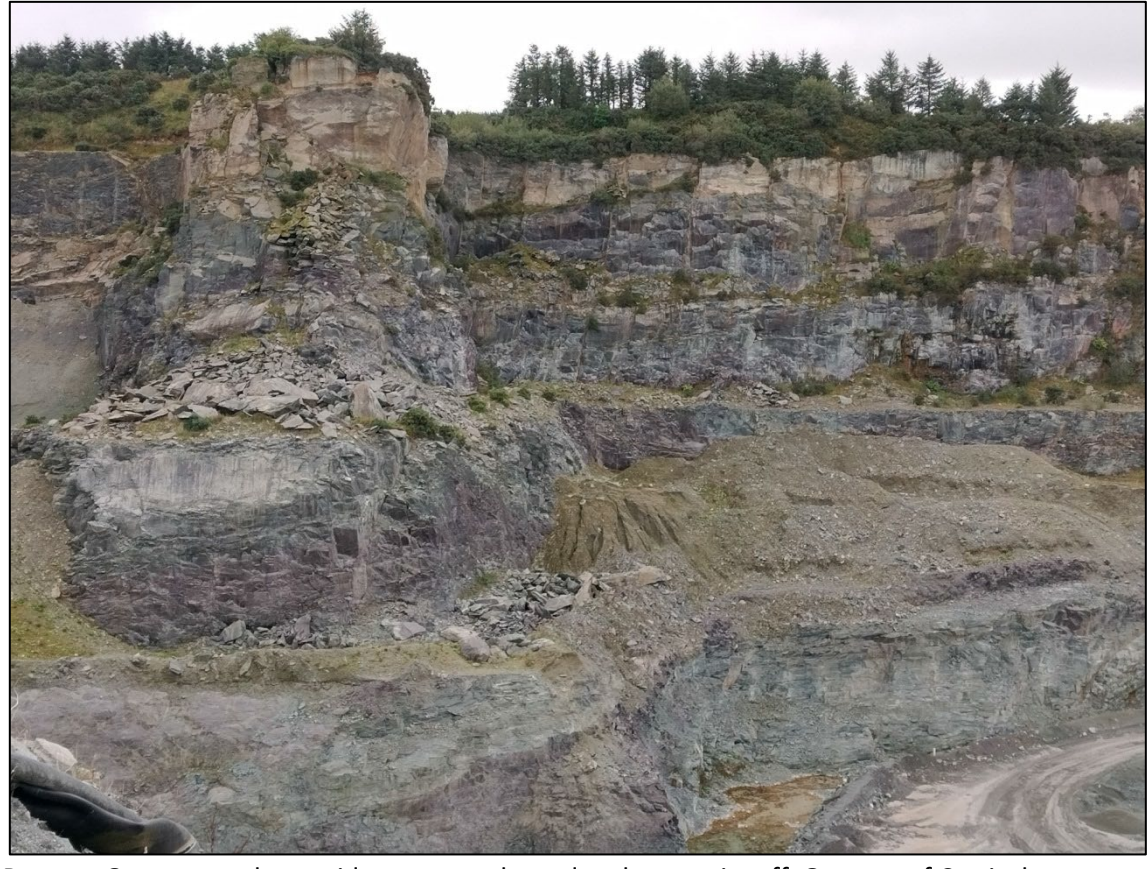
Bweeng Quarry, southeast side: cream-coloured rock at top is tuff. Outcrop of Carrigcleenamore Volcanic unit in Clarrigcleena CGS site is on top of rock spur on left.