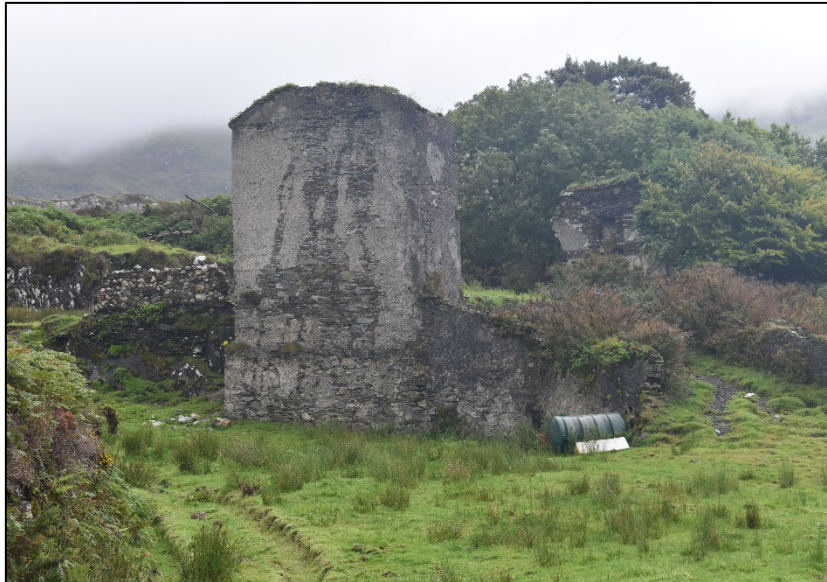
Ruins of building at Caminches Mine.