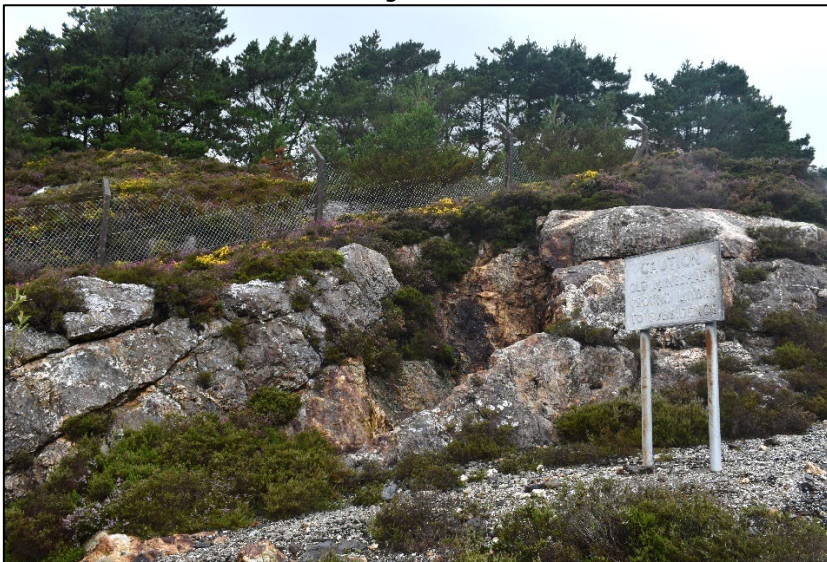
Open stope at Caminches Mine, view from east of southern part of stope, with old warning sign.