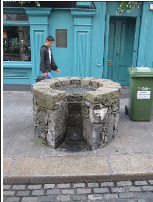
The street sign explaining the well and groundwater flows beneath the area, with the well pictured (right) and the sign on the wall behind.