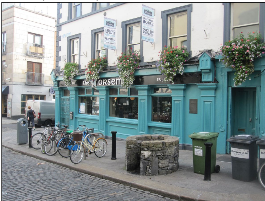
The streetscape of the well, adjacent to pubs and other premises means it is somewhat 'lost' in the mix, and subject to regular abuse of various types.