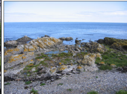
Left: A view of the island from the sand bar connection to Skerries, at low tide. Middle: The unconformable red breccia at the south-eastern end of the island. Right: A view of the typical shoreline exposures of Ordovician volcanics and shales of Shenick's Island.