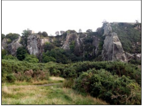
A view into the quarry from mid-level.