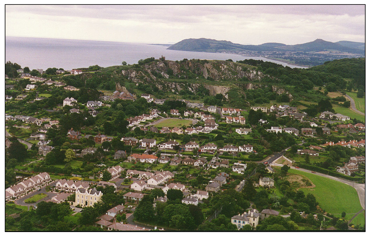
An aerial photograph of the quarry, with two levels apparent and the central inclined ramp that supported the metals – the rails of a rail system for transporting rock to Dun Laoghaire.