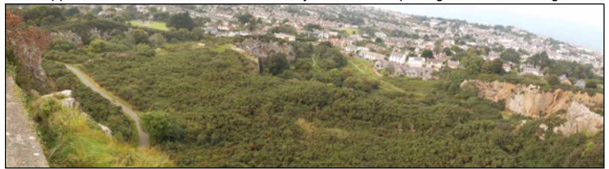
A panorama view into the quarry from the top of the quarry. The inclined plane went down the central spur of rock visible in the centre.