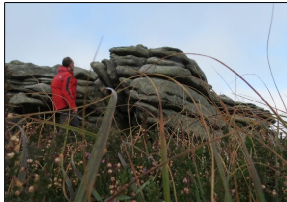
Horizontal joints on granite tor, Two Rock Mountain.