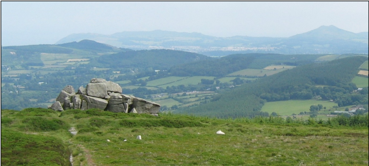
Granite tor on Three Rock Mountain looking south. In distant background: Bray Head (left); Little Sugar Loaf (right).