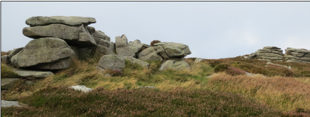
Two granite tors on Two Rock Mountain (near left and far right).