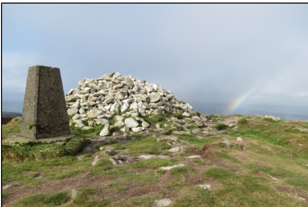
Stone cairn (archaeology) and Trig Point on Two Rock summit.