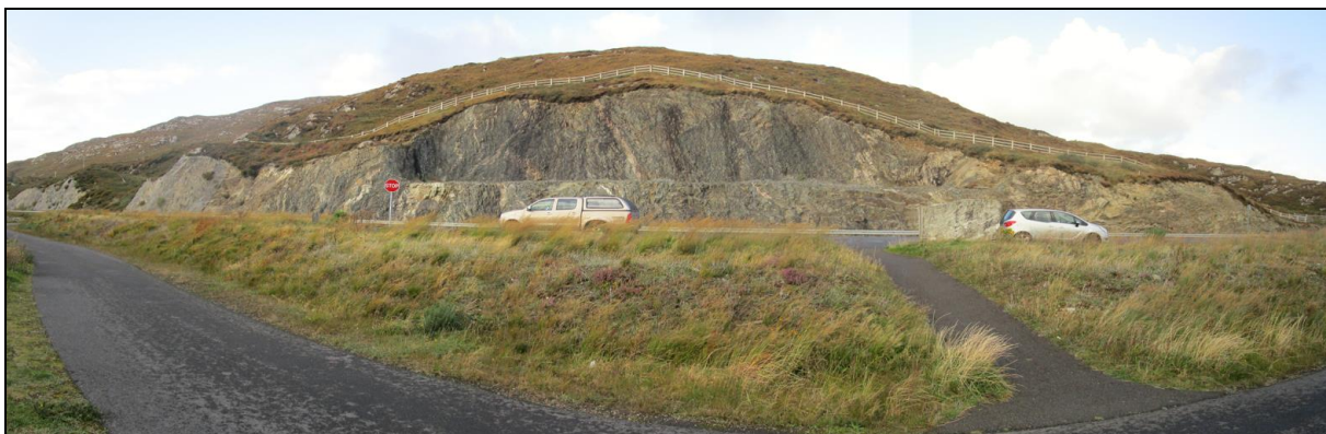
The Derrylea Road Cutting in panorama view from the cycle path beside the lake.