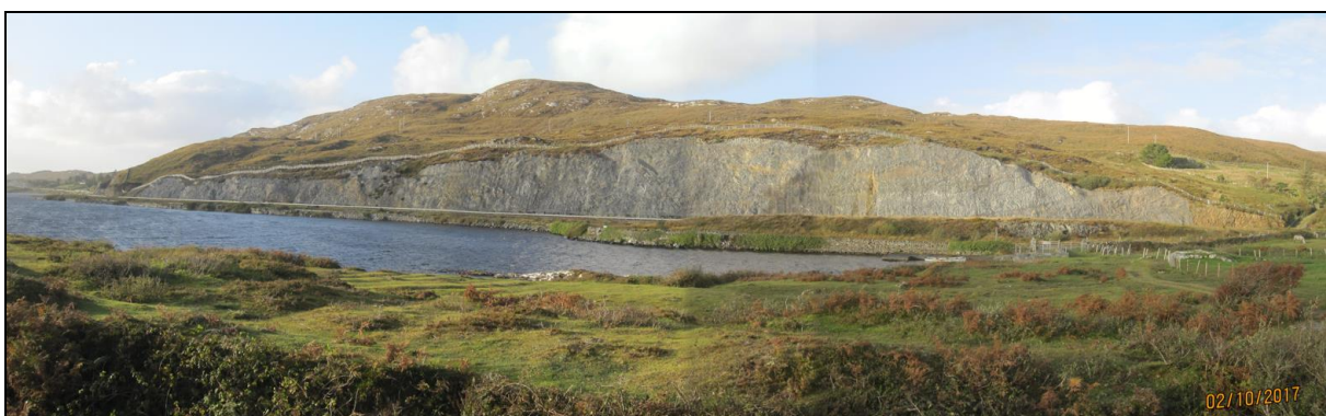
The Derrylea Road Cutting in panorama view from the causeway to the old 'mine works'.