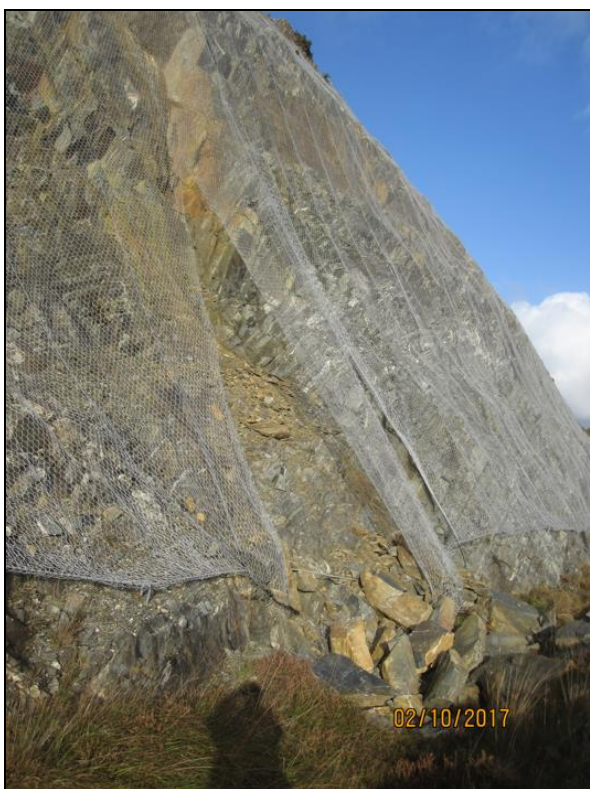
Left: The Derrylea Road Cutting metal netting has done its work in containing this rock fall.