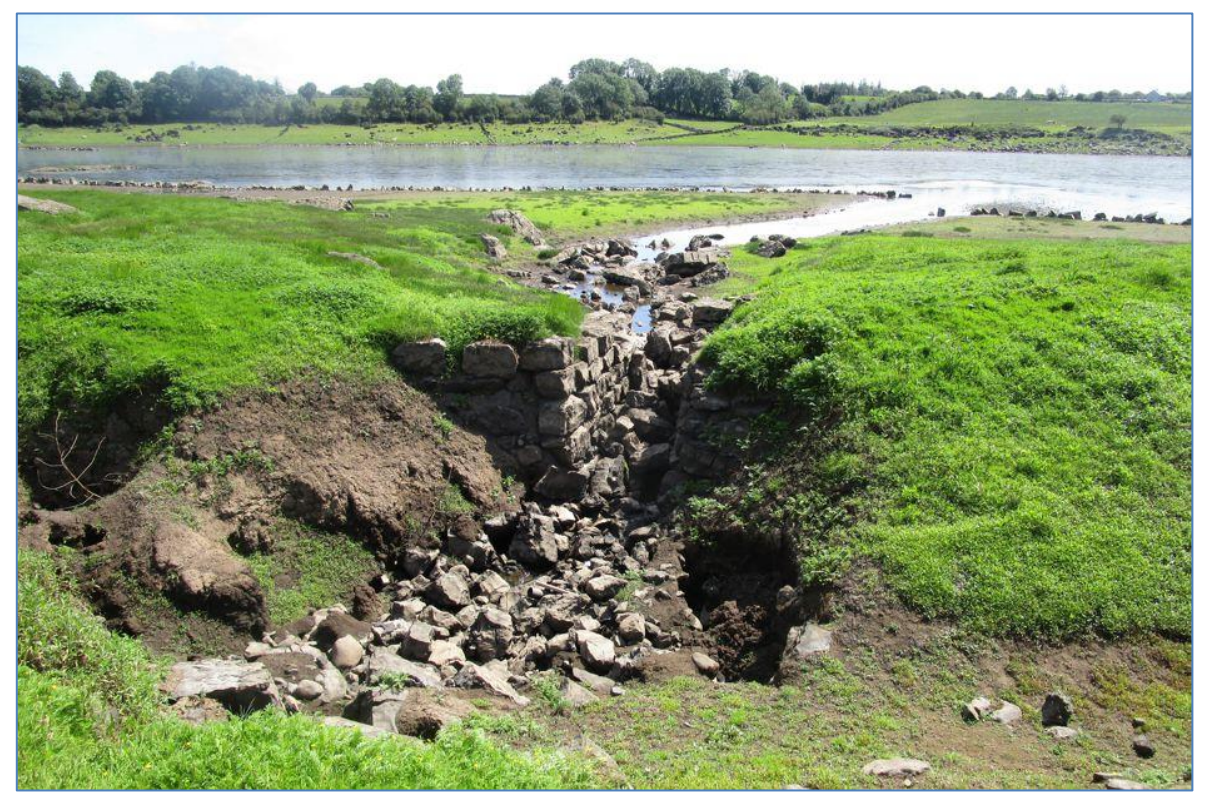
Lough Coy sink and a panoramic view.