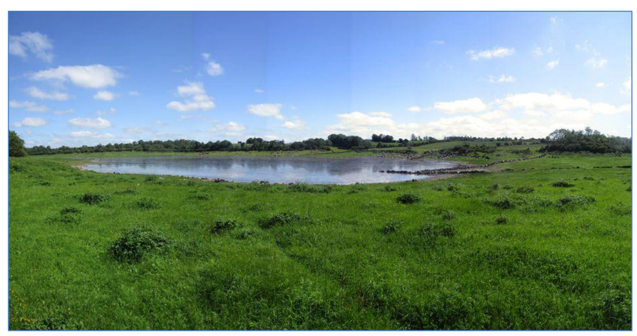
Lough Coy panoramic view.