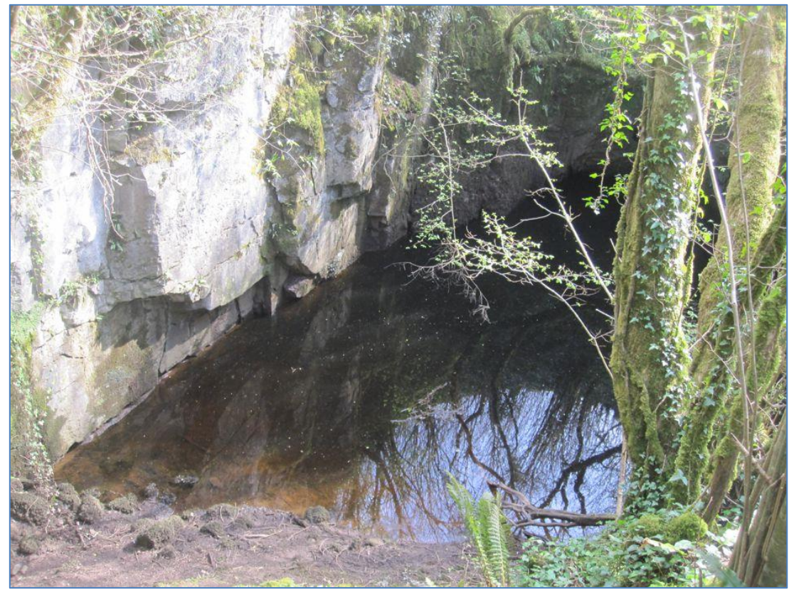
View of Pollbehan showing the permanent intersection with the water table at the bottom of the collapse feature. Only cave divers can progress from this site, which connects with Pollaloughabo.