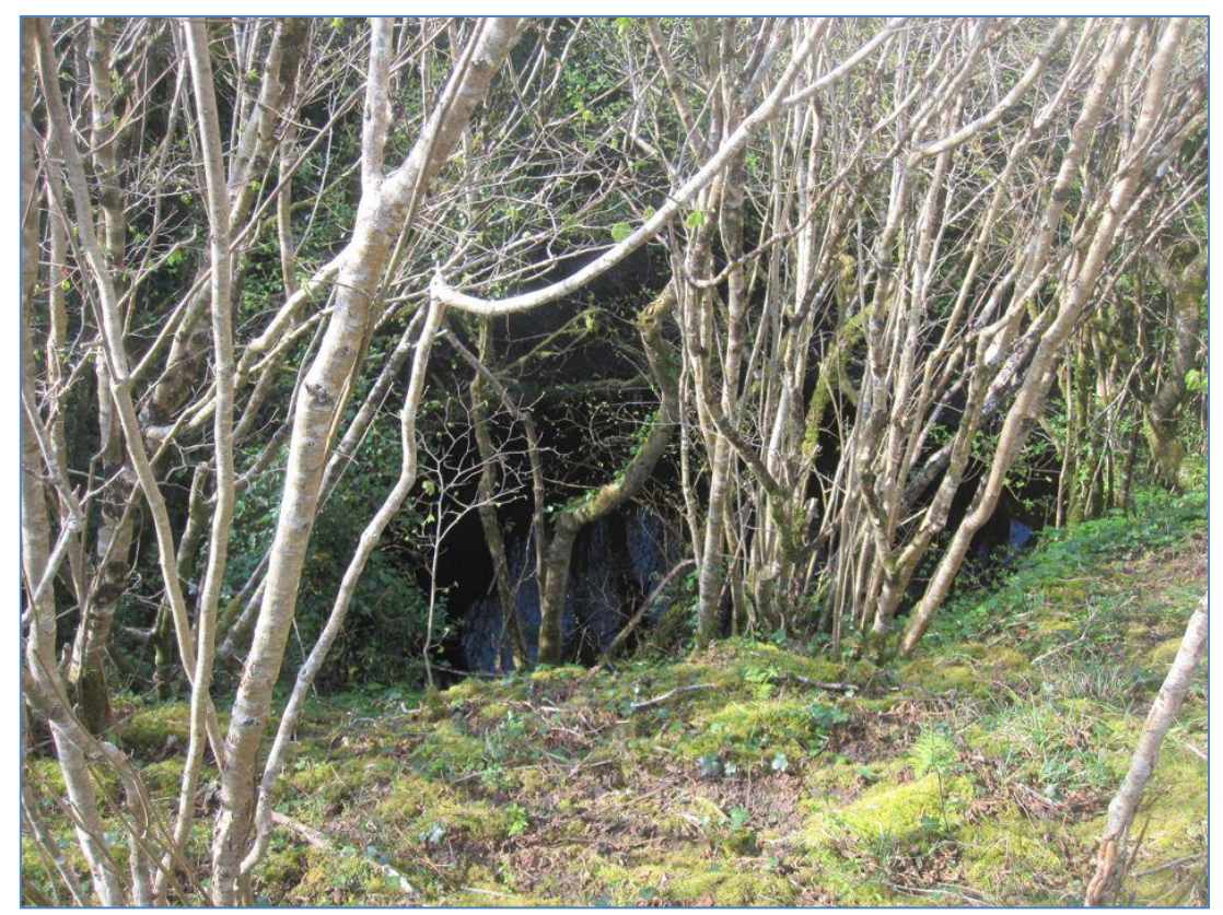
View of Pollbehan showing the heavily overgrown and very steep sides of the collapse feature.