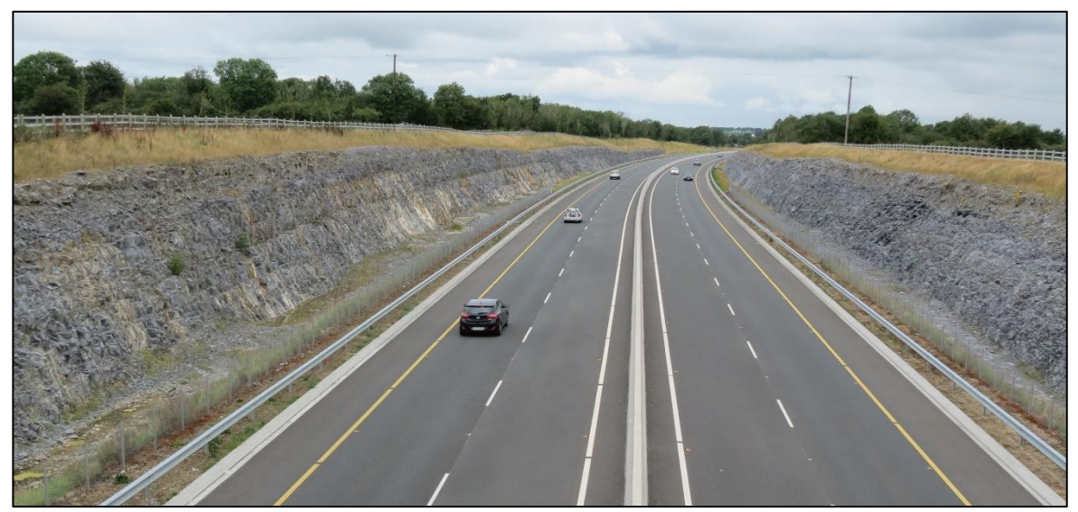
M18 road cut at Roevehagh viewed from road bridge looking north.