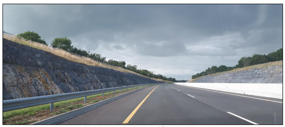
M18 road cut at Roevehagh viewed from northbound lane.