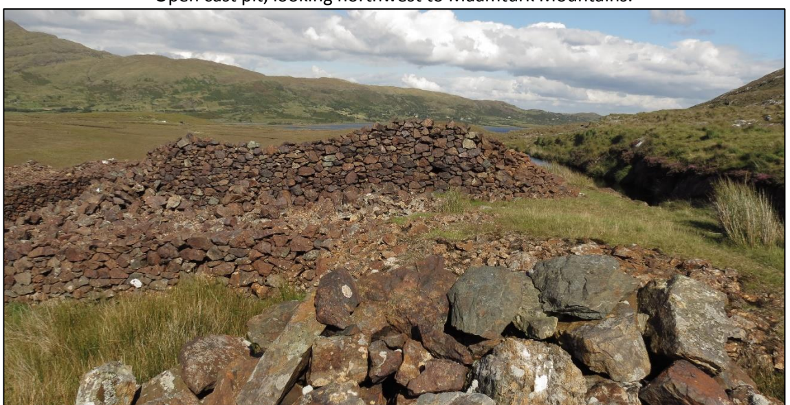
Spoil heaps at mine site. Looking southeast towards Lough Corrib.