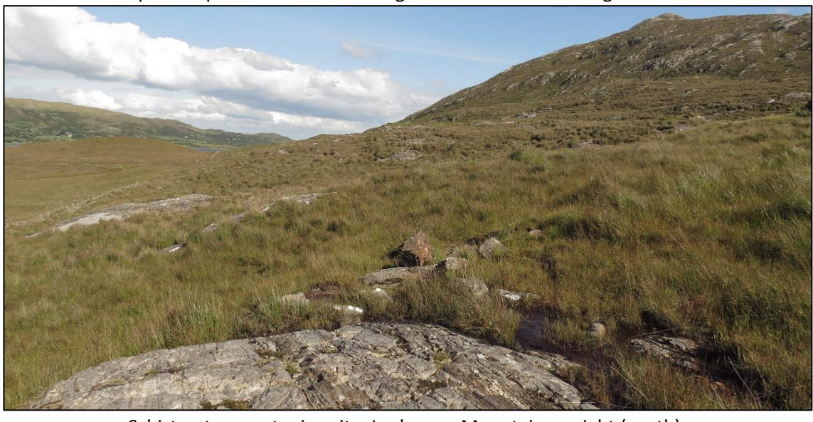
Schist outcrops at mine site. Leckavrea Mountain on right (south).