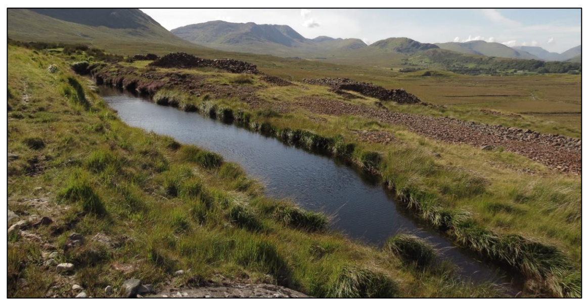
Open cast pit, looking northwest to Maamturk Mountains.