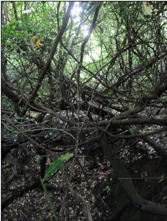
One of the main exposures.