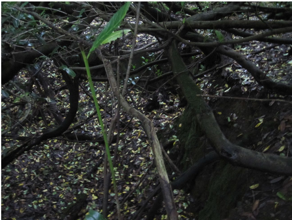
A better exposure in the main fossil locality, in daytime daylight, made very dark by dense rhododendron cover.