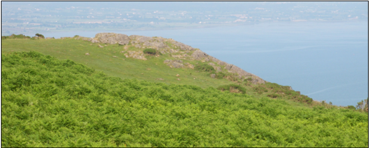
View of Slate Rock, looking northeast towards Carlingford Lough.