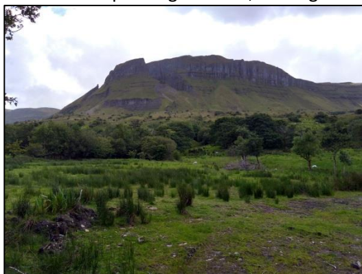
Eagle's Rock (left side of cliffs) viewed from east.