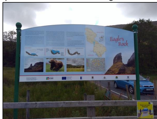
Sign-board at Eagle's Rock car park.