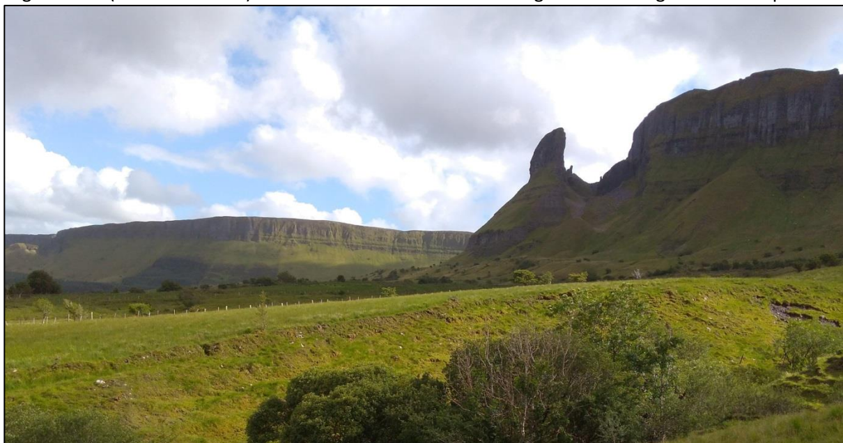
Eagle's Rock with cliffs of adjoining cirque in background, looking south from roadway that leads to summit.