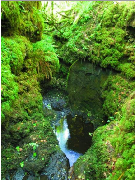
The stream gorge before the cave entrance.