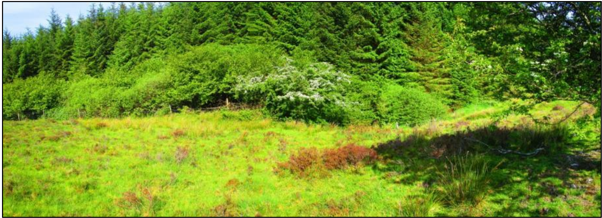
The entrance to Polticoghlan is in a stream gorge within the forestry.