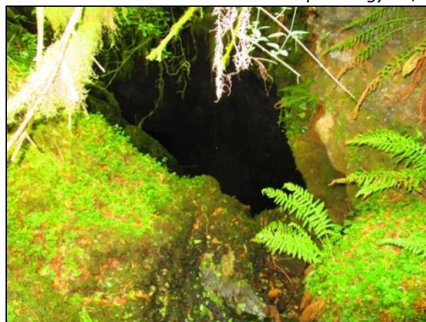
A view into the chasm.