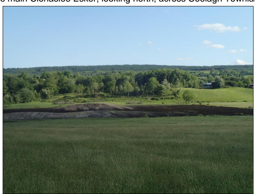
Looking north across haphazard esker topography and the flanking Derry Bog, in Coolagh.