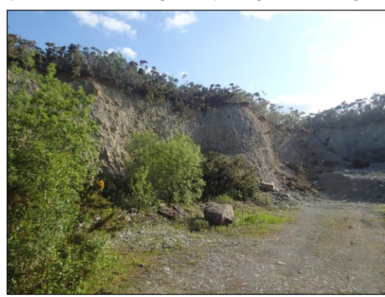
An exposure into the main esker ridge in Coolagh.