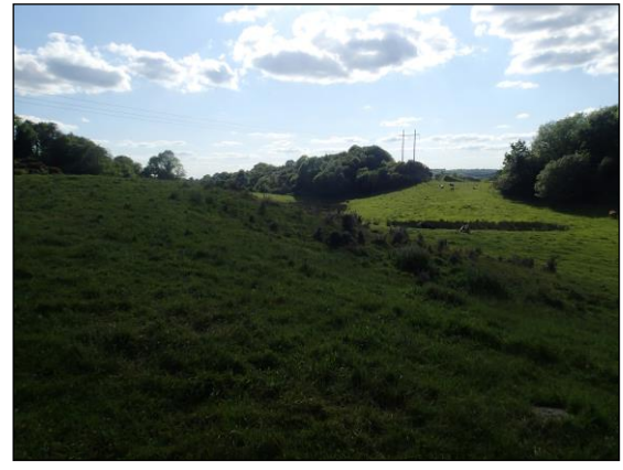
Some of the hummocky terrain where the esker and fans meet, in Garryhedder.