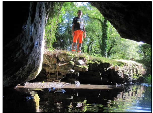
Looking out from the west entrance.