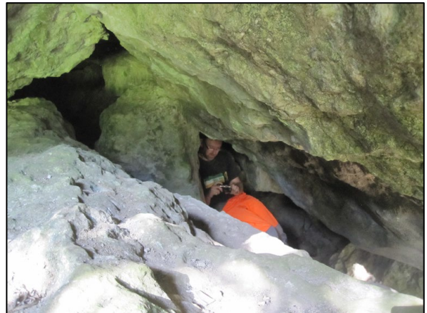
Just inside the east entrance.