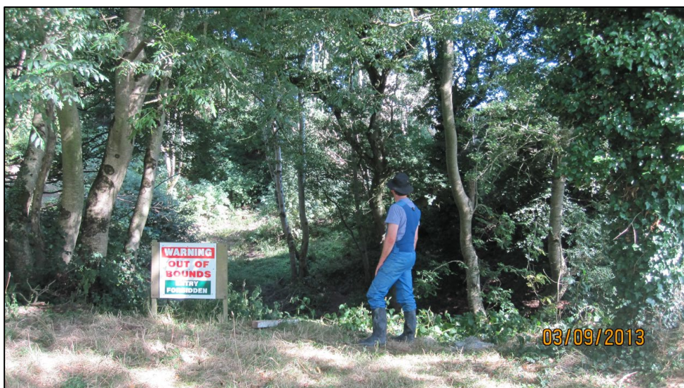
The doline north of Donaghmoyne Rising is dry and has been integrated into the golfcourse.