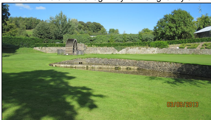
The waterwheel and pond south of the rising which were formerly reconstructed as a working feature on the golf course, powered by the rising flow.