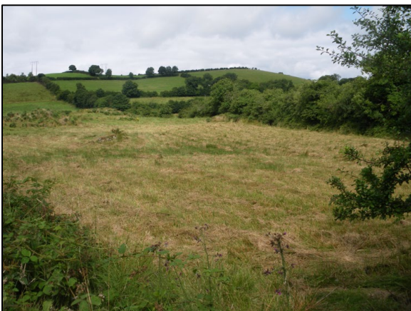
Probable site of former mine dressing floor, immediately west of chimney, now used as hay field (left).