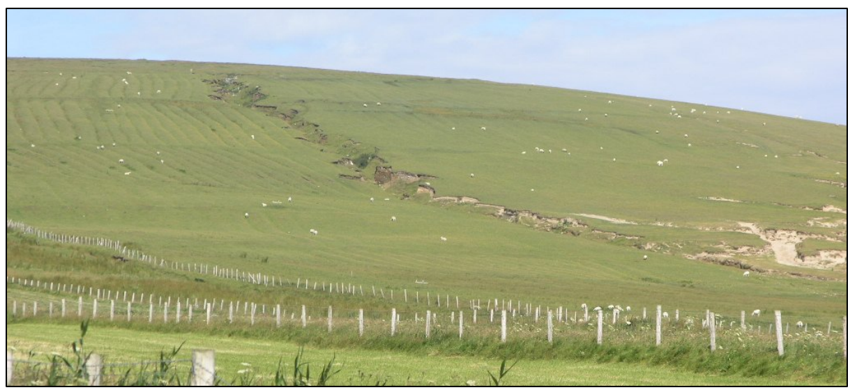
Stream gully at Carrowteige, looking NE from lowlying sand dune area.