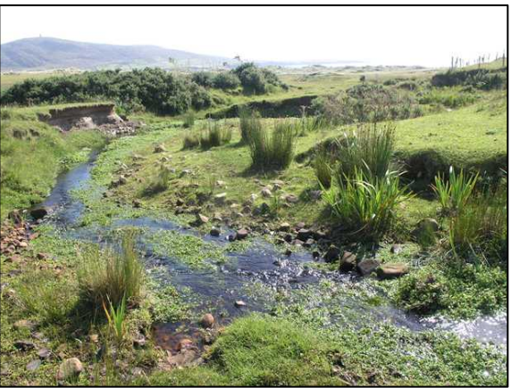
The downstream end of the stream gully on the Carrownaglogh-Carrowteige townland boundary, looking south to Broadhaven Bay.