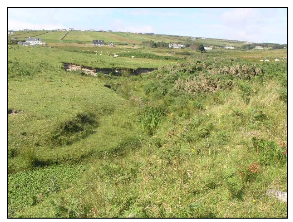
The downstream end of the stream gully on the Carrownaglogh-Carrowteige townland boundary, looking north.