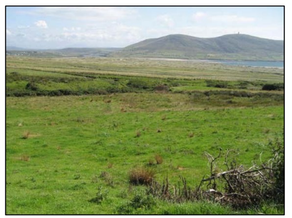
Stream gully running north to south (left-right). Dooncarton tower in distance.