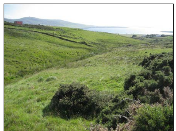
The upstream end of the stream gully on the Carrownaglogh-Killgalligan townland boundary.