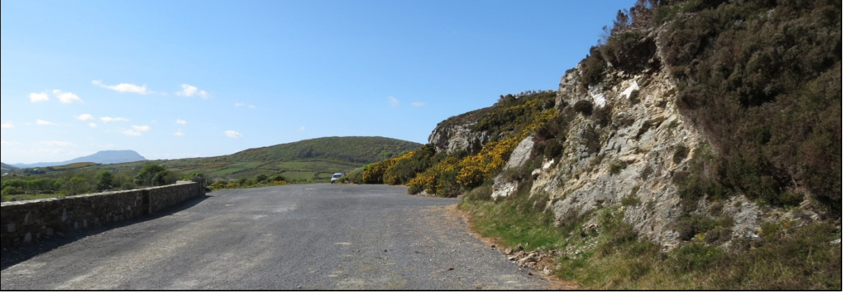
Parking area by the cemetery at Kilgeever, looking NW. Summit of Knockmore (Clare Island) visible in distance.