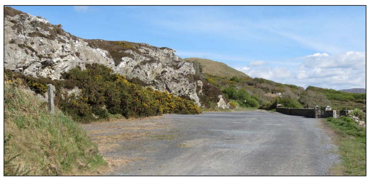
Outcrops in low cliffs at parking area by the cemetery at Kilgeever, looking SE.