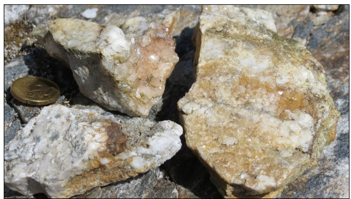
Samples of quartz at Kilgeever.