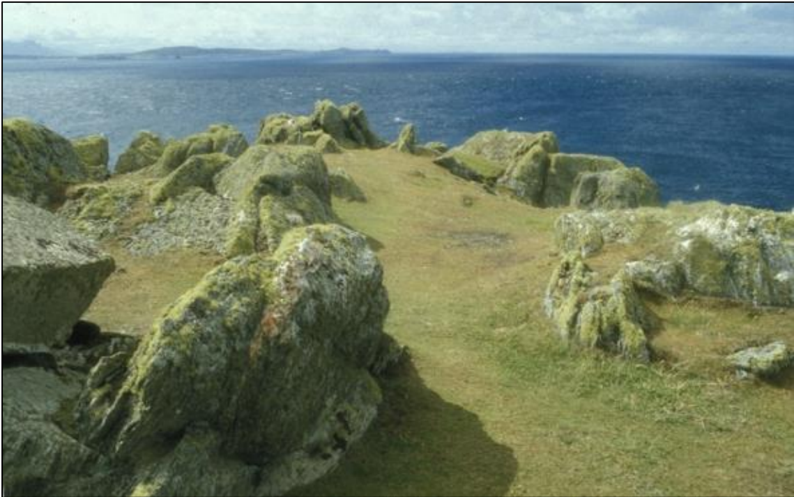
The west side of Inishtrahull.