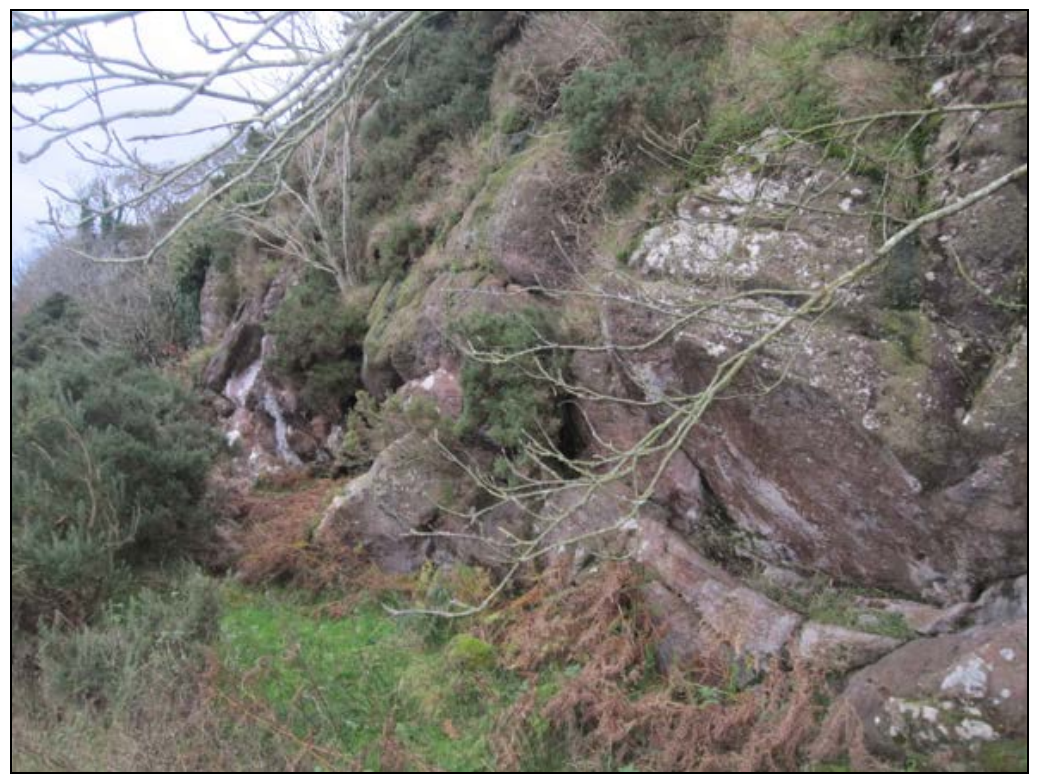
The steeply dipping beds of Devonian sandstones at Knockalla.