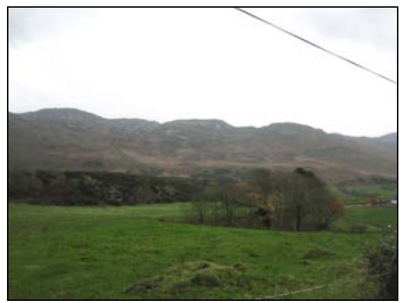
The cliff of Devonian sandstones at Knockalla, with the Leannan Fault along the hillslope behind.