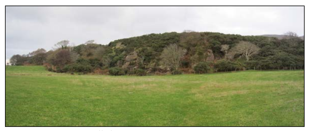
The cliff of Devonian sandstones at Knockalla.