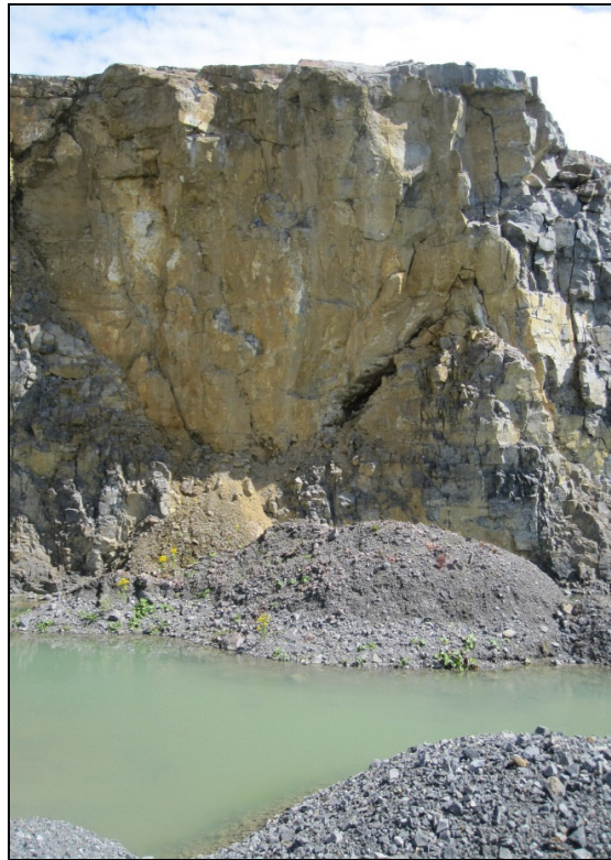
A calcite stained fissure in the quarry face.