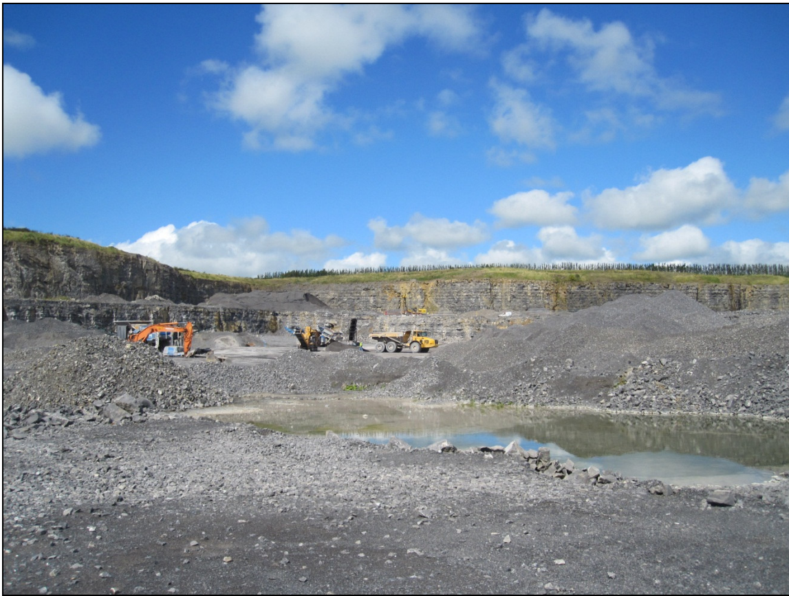
A general view of Castlemine Quarry from the quarry floor.