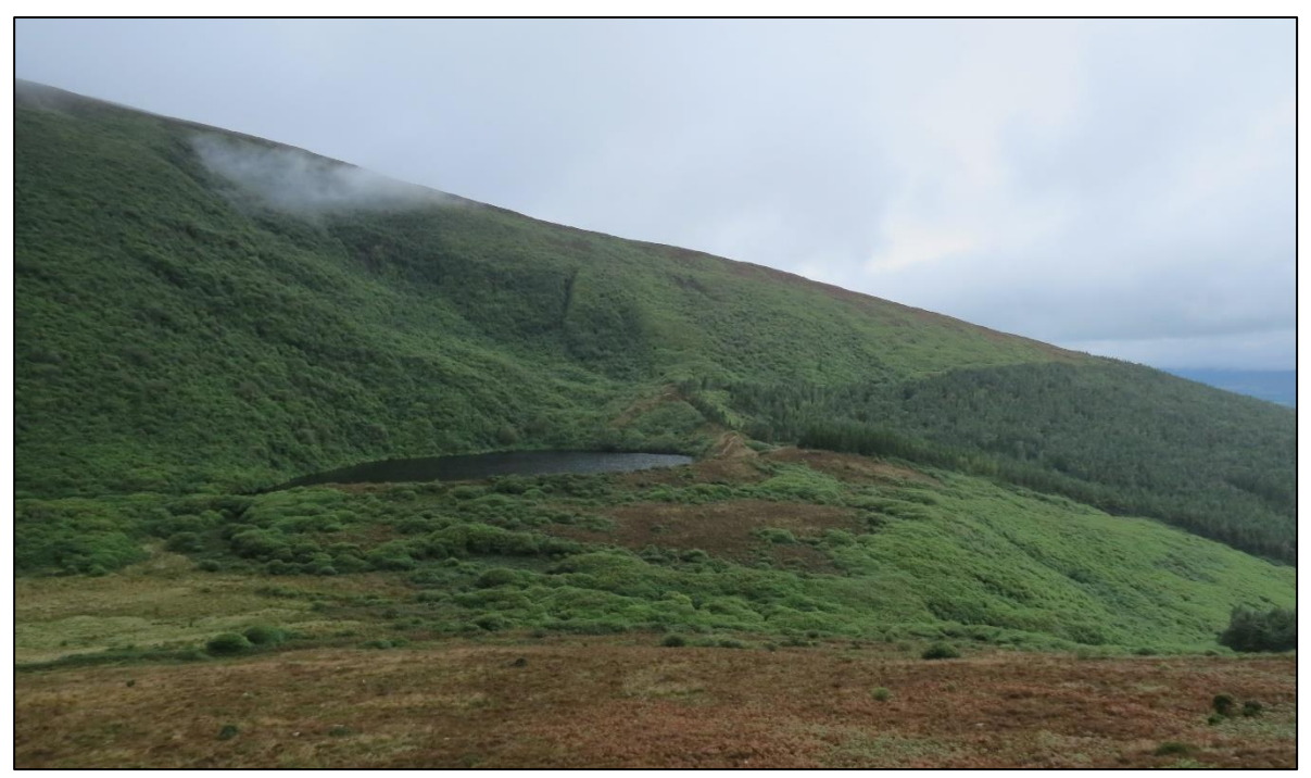
Corrie and Bay Lough from R668 viewing point.