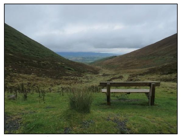
View north from parking area out The Gap.