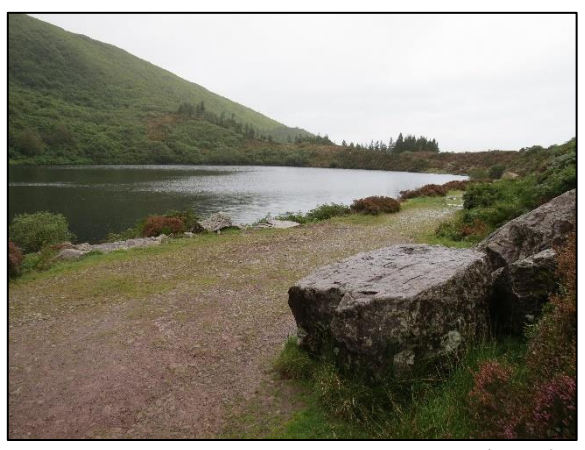
Track alongside Bay Lough and moraine (right).