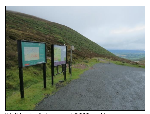
Walking trail signage at R668 parking area.