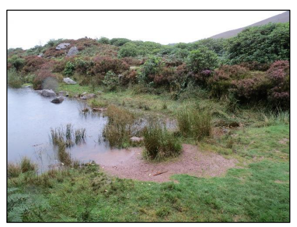
Lake outflow at southeast side of lake by the track.