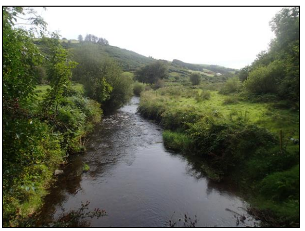
The fast-flowing Clodiagh at Ballynahow. See the wider, steep-sided valley, which is probably a glacial meltwater channel.