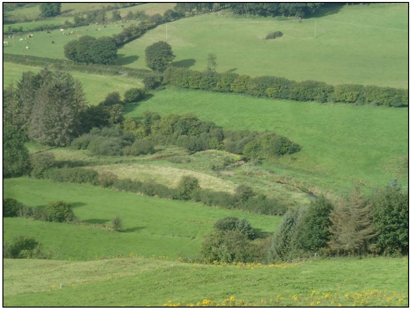
A portion of the meandering stretch of river, at Glastrigan.