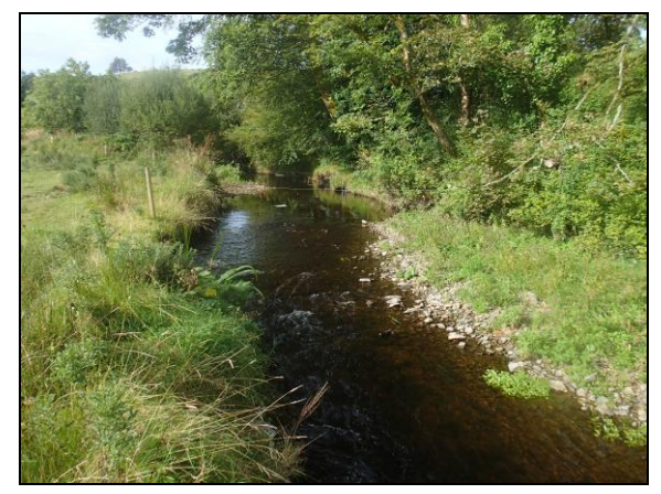
Point bars being formed on the inside loop of the Clodiagh River at Knocknagarve.