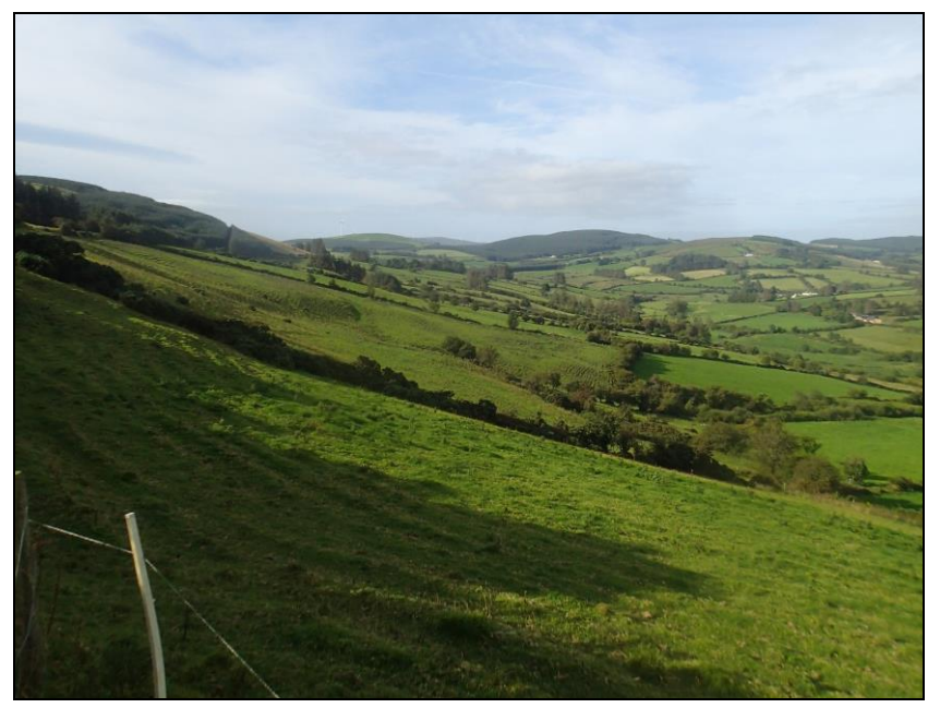
The Clodiagh River Valley, looking west from Garranakilka.