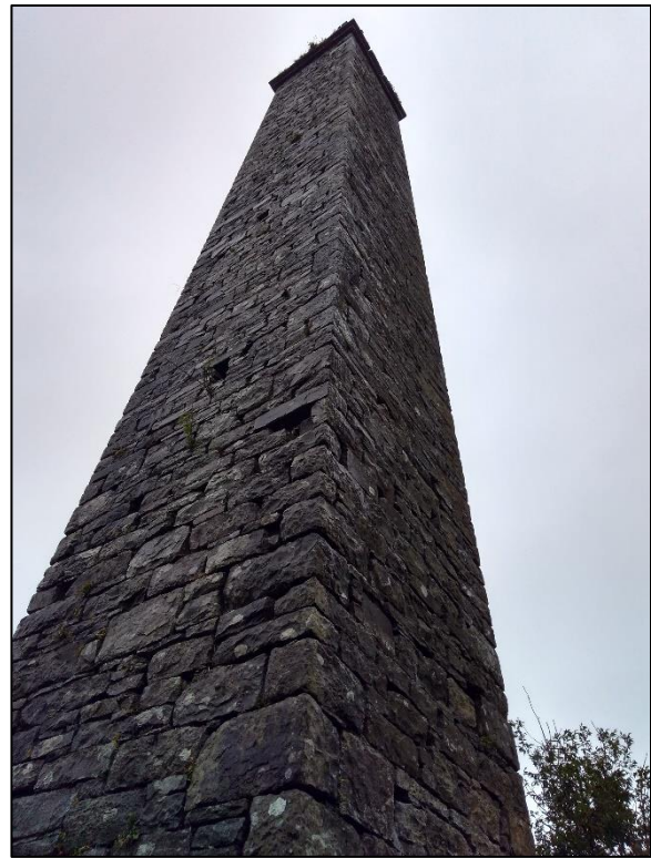
Engine house chimney, Coalbrook