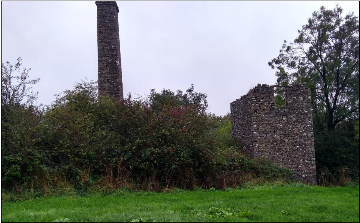
General view of Coalbrook