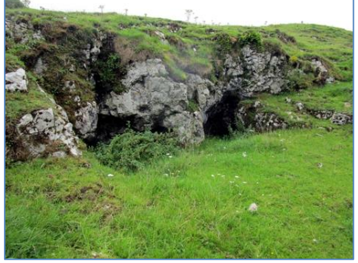
The small solutional 'caves' on north side.