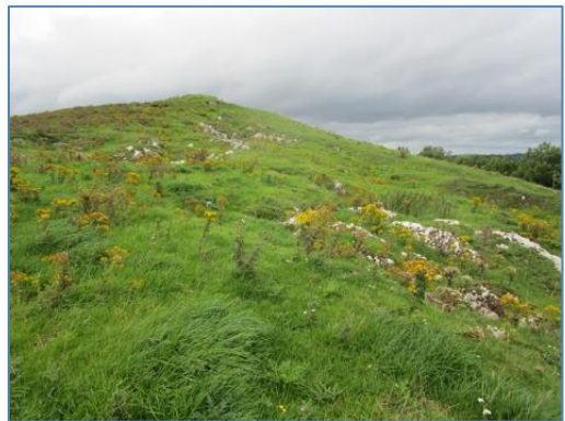
A view of summit from the quarry.