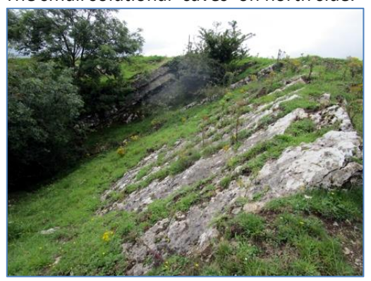
Dipping 'reef' flank beds in the quarry.

Gallagher et al. 2019. Geological Survey Ireland.