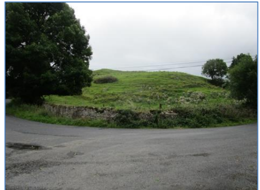
The western side of Knockordan Hill.