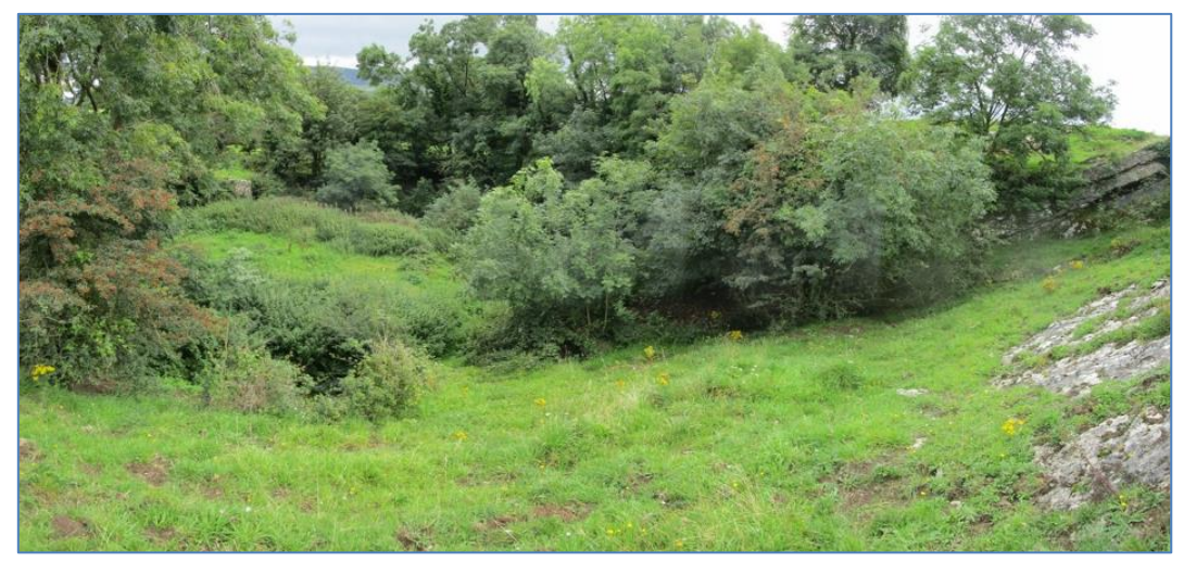
A view into the quarry on the eastern side of Knockordan Hill.