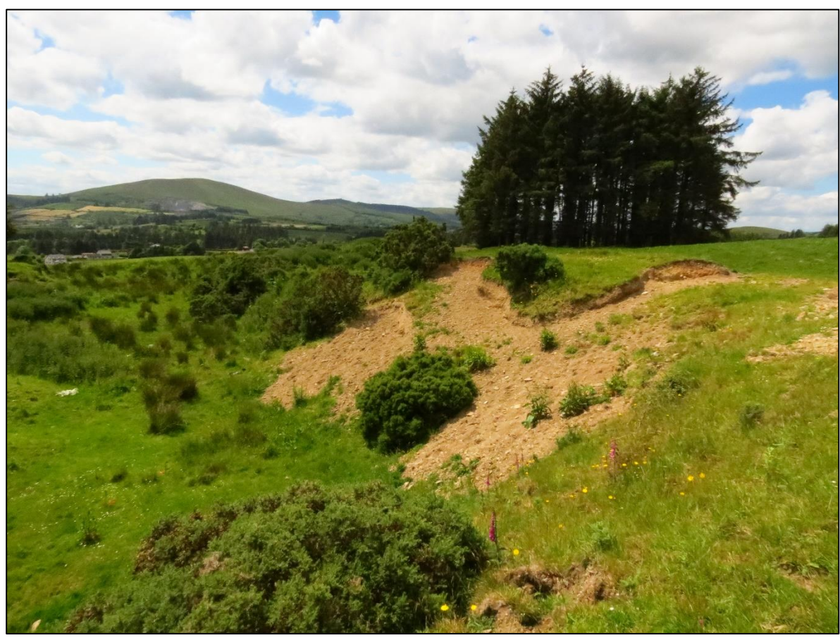
Sand and gravels exposed in disused quarry pit at Baurnadomeeny. View southwest towards Cullaun (460 m) hill.