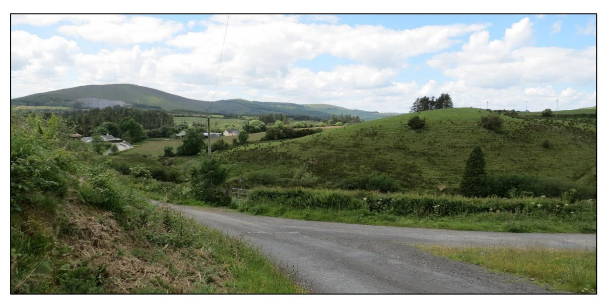
Moraine terrain at Reardnogy More townland. View south-southwest towards Cullaun (460 m) hill. Quarry visible on hillside.