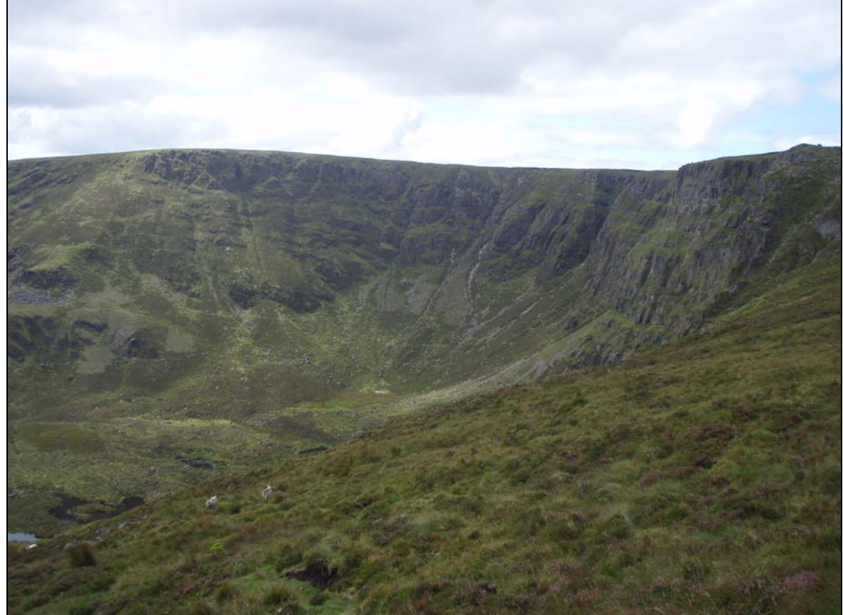
The backwall at the northern end of Coumtay.