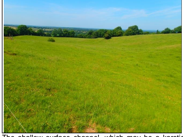
The shallow surface channel, which may be a karstic dry valley, at the western shoulder of the hill.

Meehan et al. 2019. Geological Survey Ireland.