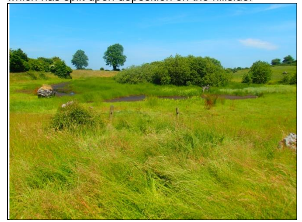
The small pond at the northeastern end of the Hill of Uisneach site.

'Ail na Mireann', or "The Stone of the Divisions' (also called 'The Catstone'), which is a large erratic boulder which has split upon deposition on the hillside.