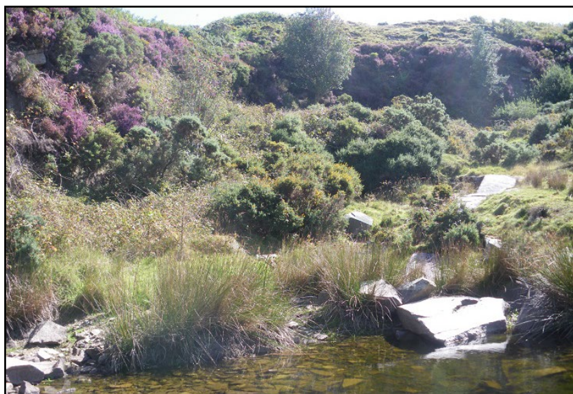
Aughrim Quarry: Lower quarry, view from west.