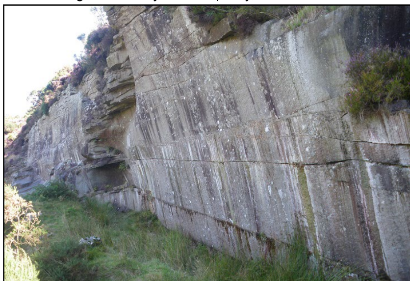
Aughrim Quarry: Upper quarry, view northwards along eastern face.