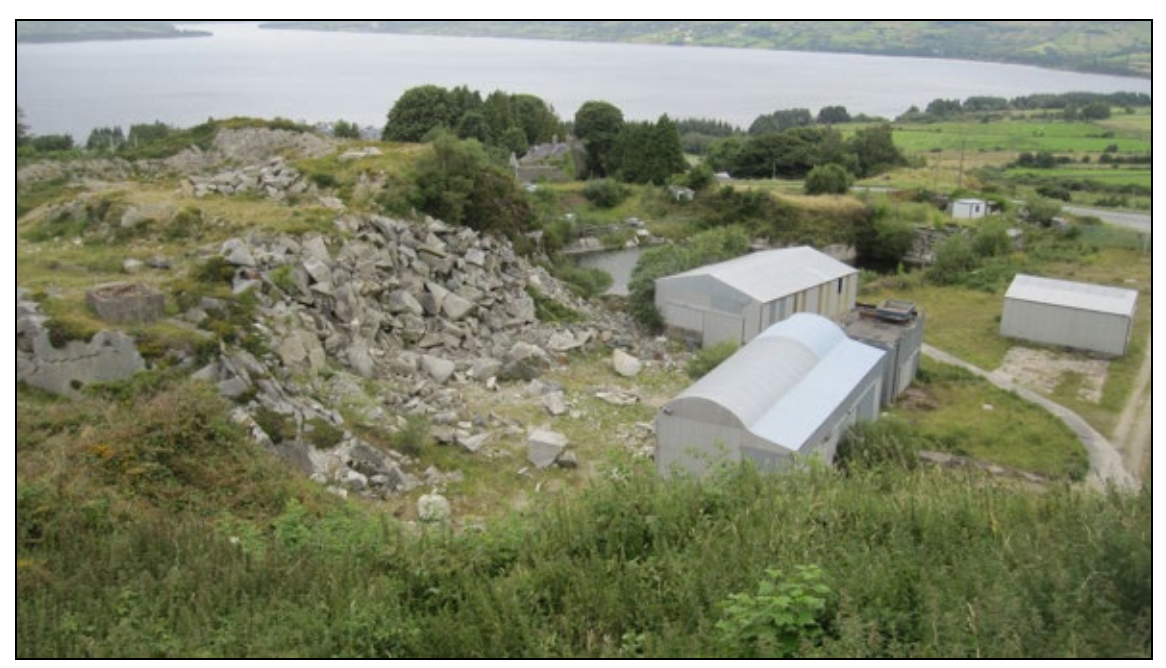
The main quarried area, formerly Creedon's Quarry viewed from the road to the south.