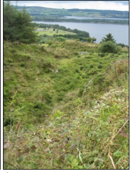
Overgrown old quarry.