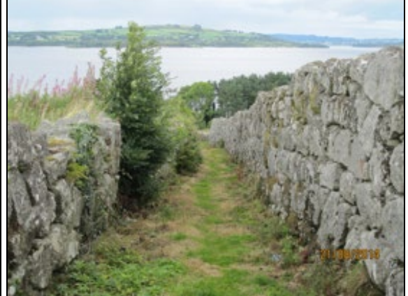
Madonna carving, fencepost and view down the Horse Lane, with 2.5m high walls in places.