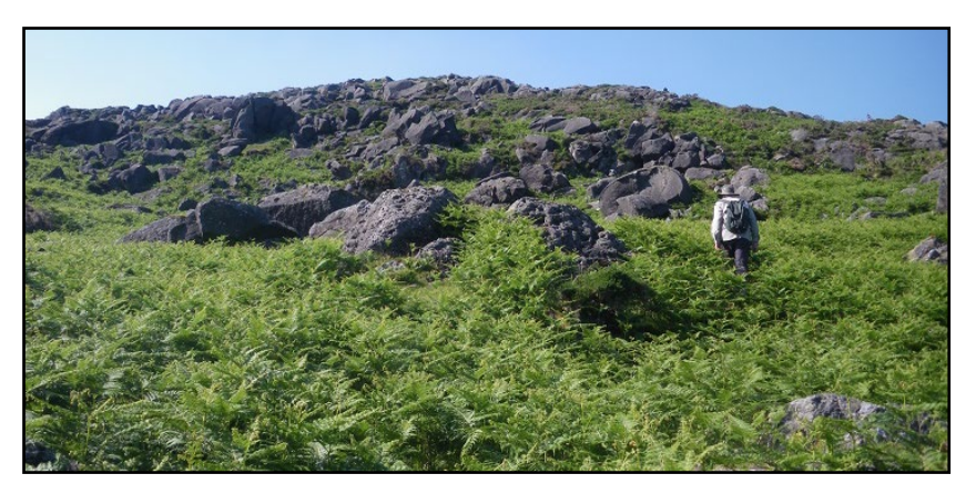
Camaderry Appinite: view from south of main outcrop area.