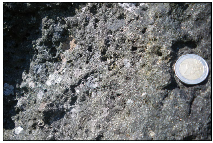
Camaderry Appinite: pitting on surface owing to weathering of crystals.