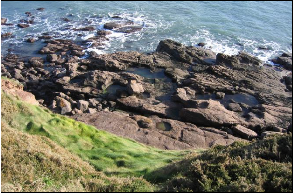
There are more than 15 'dishes' where millstones were removed in this view.