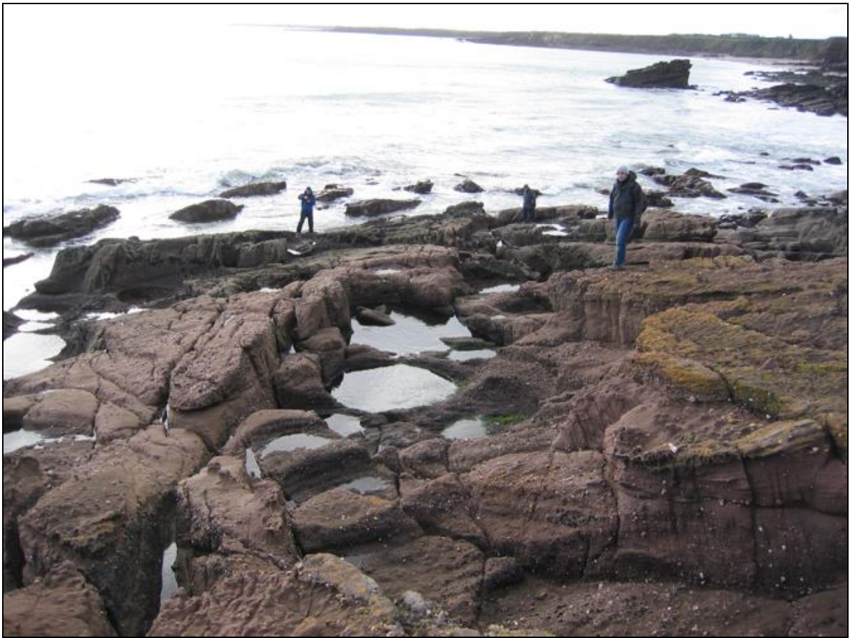
A series of multiple 'dishes' where millstones were removed.